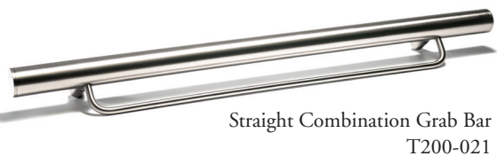
Straight Combination Grab Bar T200-021