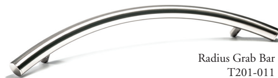
Radius Grab Bar T201-011