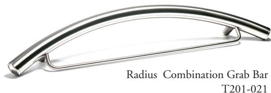
Radius Combination Grab Bar T201-021