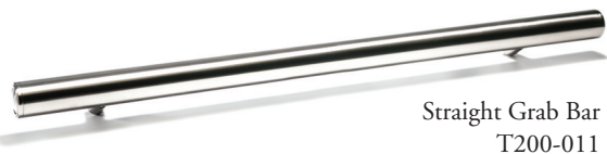
Straight Grab Bar T200-011

All Grab Bars are 24-3/16" L x 1-1/4" Tubing x 2-5/8" W