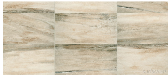
Almond Sands (Shown Above)