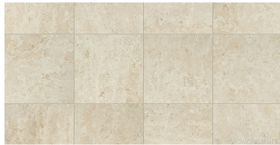
Fossil (Shown Above)