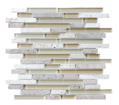
Nutmeg 5/8 Random Strip