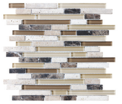
Ginger 5/8 Random Strip