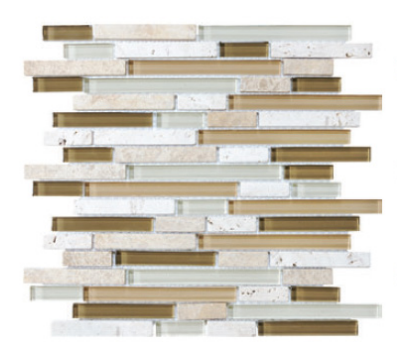
Cinnamon 5/8 Random Strip