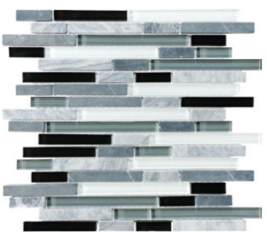
Pepper 5/8 Random Strip