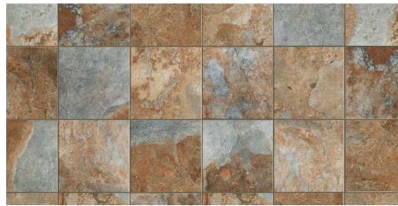
Multi Dark (Shown Above)